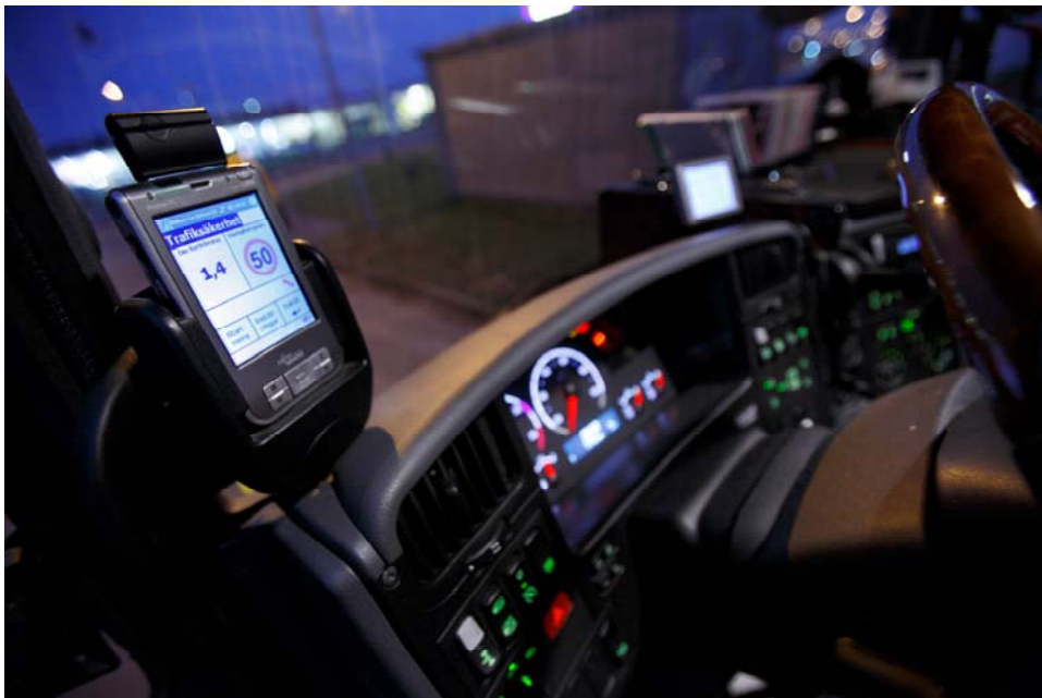
Figur 1 The ISA solution developed in this project, installed in a truck

This project aims to study whether truck drivers speed and seatbelt usage can be improved using an ITS platform, combined with knowledge and motivation. To study this, a field operational test including eleven hauliers been carried out.